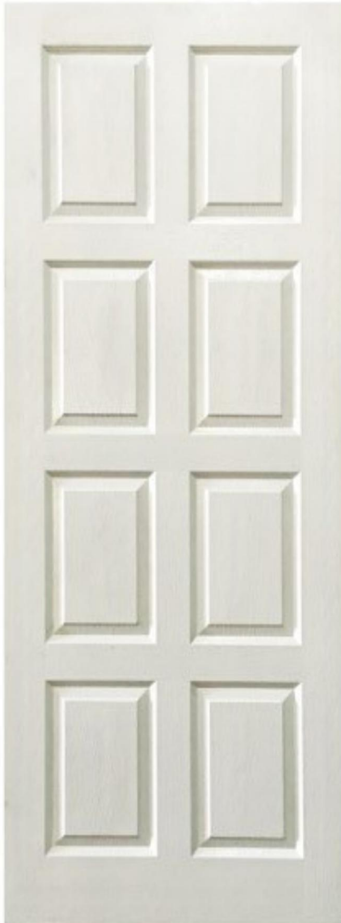
Eight panel - current style