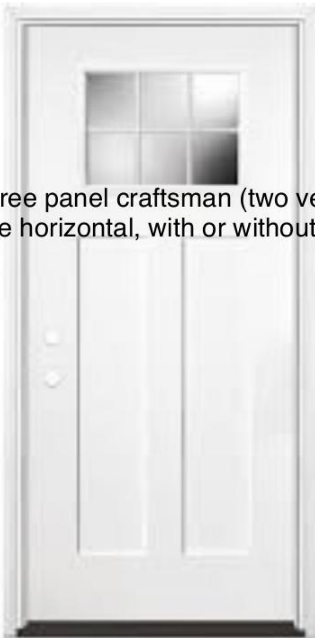
Three panel craftsman (two vertical, one horizontal, with or without glass)