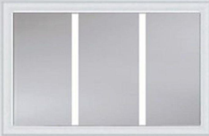
Four panel (three vertical, one horizontal, with or without glass)